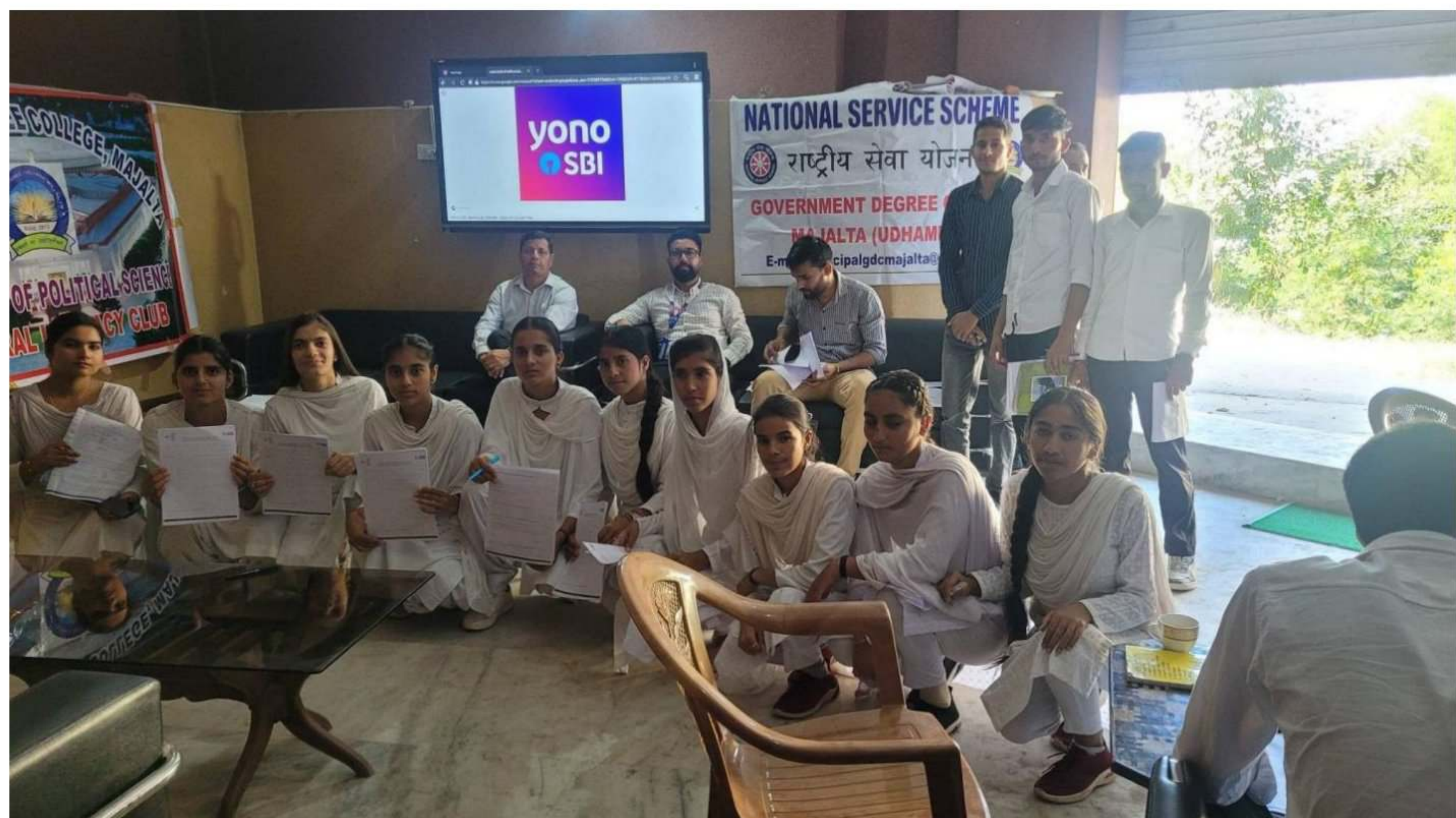
NSS Unit of GDC Majalta in Collaboration with SBI Mansar organised one day awareness Programme at Multipurpose hall GDC Majalta